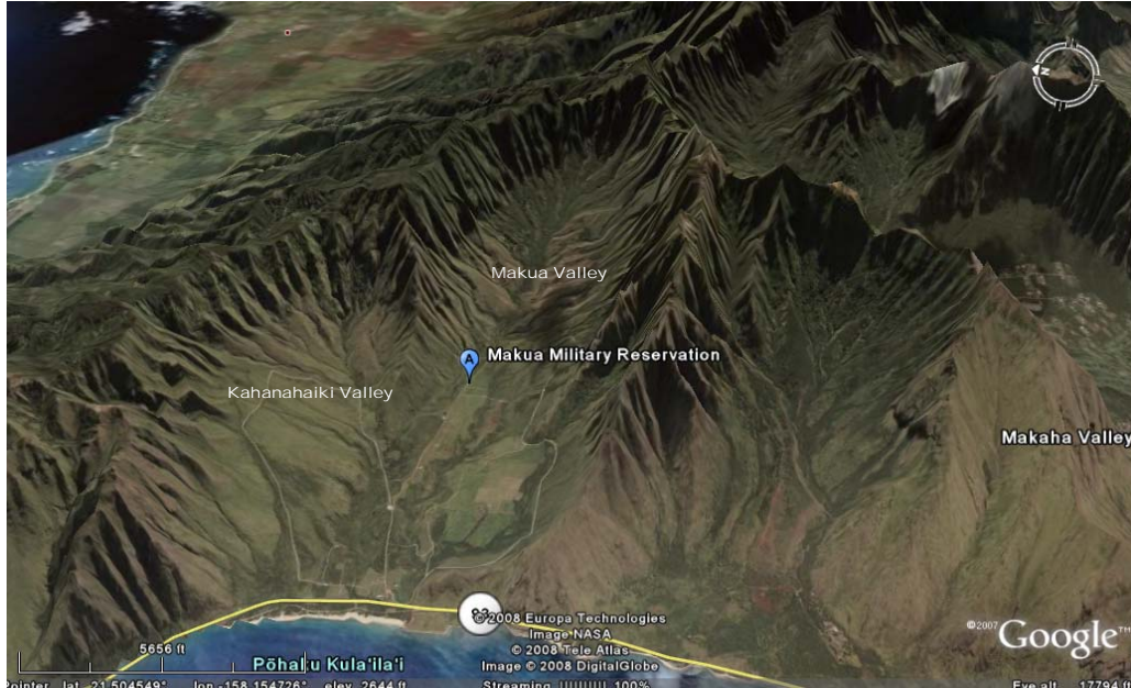
Figure 6. Makua Military Reservation, Northeast Corner of the Island of Oahu

The reservation covers 4,856 acres (globalsecurity 2008b). It has a beautiful shoreline and two valleys, the Makua and the Kahanahaiki that drain to the Wai'anae Coast (Lucking 2001). The Makua Valley has been used by the Army and other United States military forces as a training area since before World War II. Steep cliffs partially surround the impact area from the southwest to the north. The cliffs are too steep to be used for maneuvers. Several thickly wooded gullies cut through the impact area and the cliffs (Figure 7). The soils in this valley are similar to those found at Schofield Barracks. A forest reserve is to the north and to the south with the Waianae Mountain Range to the east (globalsecurity 2008b).