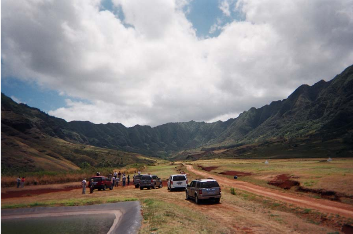
Figure 7. Looking to the east in Makua Valley on the Makua Military Reservation

The Army has been responsible for the site since 1943; however, the training area has also been used by the Marine Corps, Coast Guard, Air Force, the Army Reserve, and the Hawaii Army National Guard (Onyx 2001). Currently, for legal reasons, this site is not being used as an active training area. In the past, the Makua Valley has been subjected to air bombing, ship to shore firing, amphibious operations and live firing of infantry and artillery weapons leaving the reservation dotted with unexploded ordnance. Since 1950, there have been several clearing operations that included controlled burning of undergrowth and detonating unexploded ordnance, but the site is still known to have a variety of unexploded ordnance. In August 1998, five World War II-era bombs were discovered while surveying and mapping the site. These bombs were safely detonated. Later, 81 smaller pieces of unexploded ordnance were located and detonated (Lucking 2001). Although the use of the M101 spotting rounds has not been confirmed at Makua, it is possible that training on the Davy Crockett recoilless guns could have taken place at this site due to the size of the firing range.