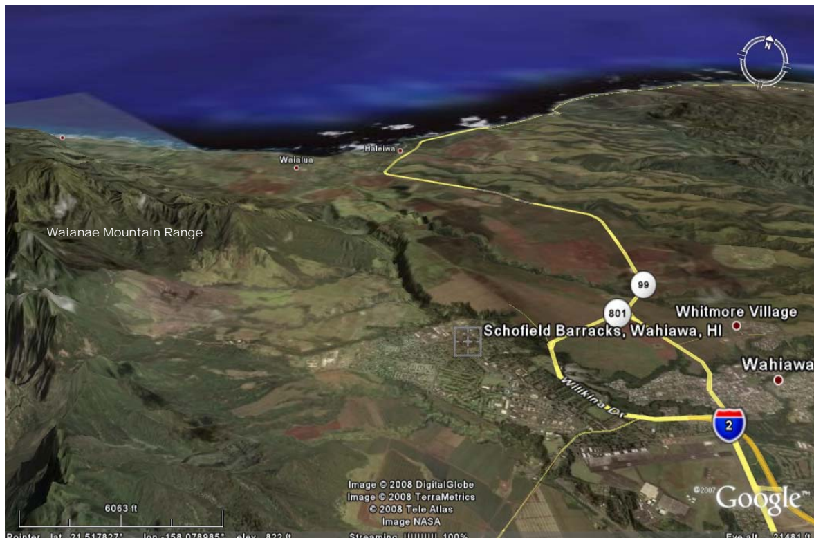
Figure 3. Schofield Barracks, Center of the Island of Oahu

The training area has maneuver training areas, firing ranges and impact areas. The impact area is on the eastern slope of the Waianae Mountain Range and extends eastward toward Highway 801 (Figure 3). The steep slopes to the west and southwest are unsuitable for maneuvers but provide a safety zone for the impact area. The firing ranges are primarily along the eastern and southern boundary of the impact area (globalsecurity 2008a).